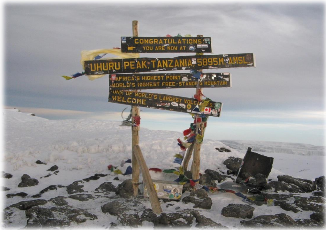
Mount Kilimanjaro summit, 1998.